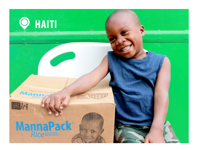
PHOTO LOCATION Designate the country that the photo is from with the pin icon when possible.